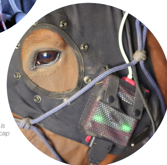
Figure 5: A small portable amplifier is tucked on the side of the cap