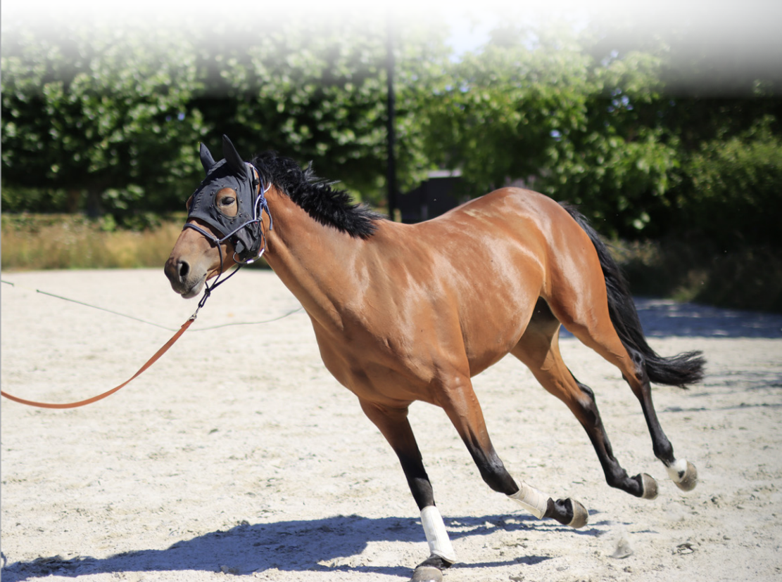
Figure 1: The EEG system allows for the monitoring of brain waves during exercise...

Mammal.tech aims to address this problem with an easy-to-use device which allows for a direct collection of brain activity data before, during and after exercise, just like in human high performers. Thanks to a streamlined analysis pipeline, these data can then be used to generate concise individual reports to highlight stress levels, fatigue, sleep quality and other parameters essential for the animal's well-being and performance. Along with this report, appropriate recommendations and treatment options are provided to the animal's carer to facilitate their decision-making.