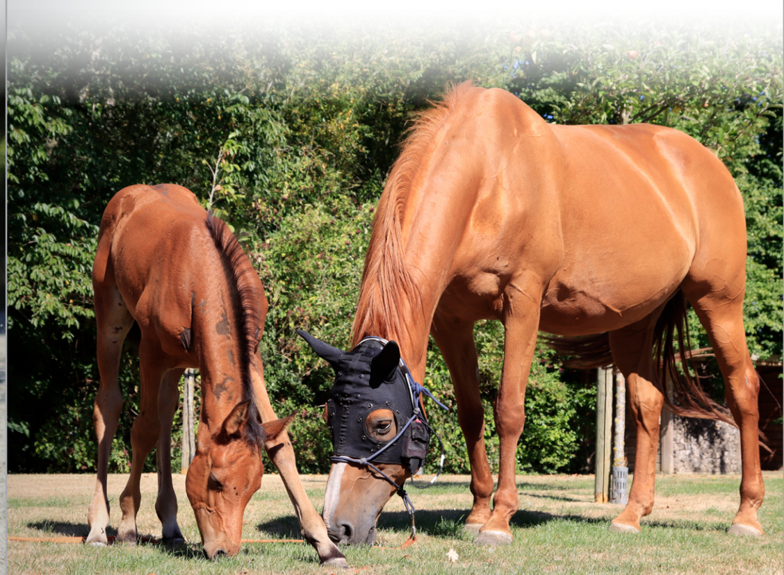
Figure 2: ...and during social interactions, to evaluate the health and mental well-being of the horse.