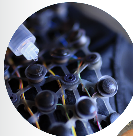
Figure 4: A grid of 24 sponge-based electrodes is built inside the cap