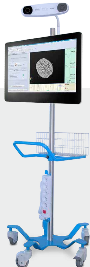
visor2 QT solution (Image may contain optional items. Actual model may vary)